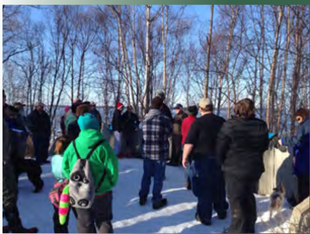
"Great turnout for the Earthquake 50 year event!"

Information panels at the overlook supplied geocachers a portion of the answers needed to complete the newly-published "1964 Great Alaska Earthquake: Earthquake Park" EarthCache ( GC51DA ). The group walked back to the Tony Knowles Coastal Trail for a descent down through the horst and graben zone to reach water's edge, completing measurements along the way to finish up requirements for the EarthCache. Throughout the walk, NorthWes gave a running commentary regarding how the '64 earthquake impacted this area. Clear sunny skies and no breeze allowed the temperature to hover near 40°F during the visit, and attendees were even graced with the presence of a moose on a mission trotting past the group. It was a beautiful spring evening for our remembrance of the 50th anniversary of the 1964 Great Alaska Earthquake.