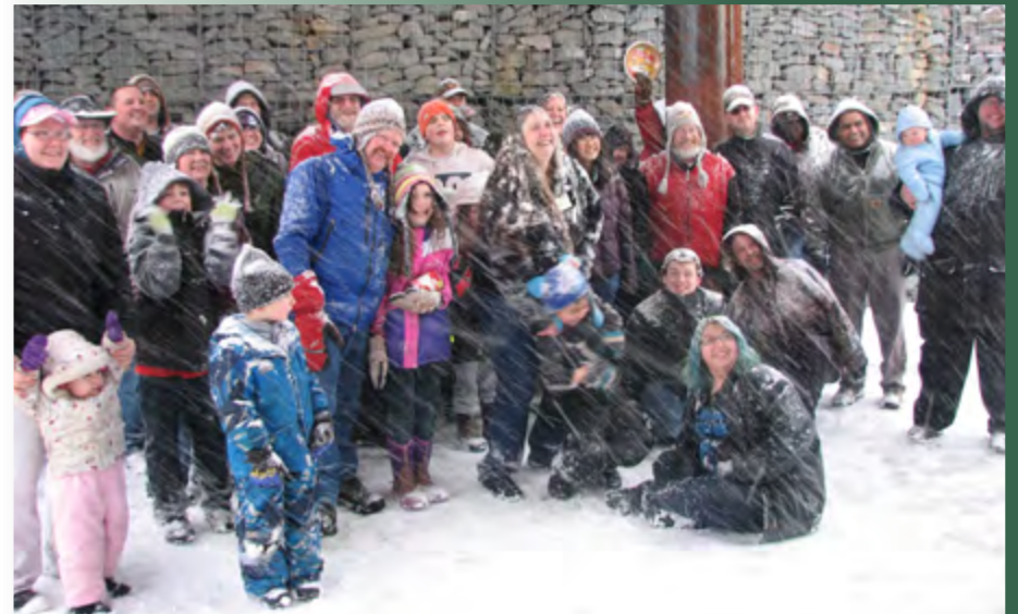
MO' PIE Group