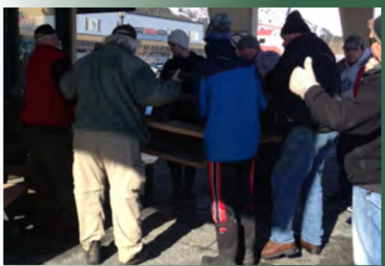
Thumbs up for the birthday folks.

The weather in Anchorage was for snow, snow and more snow! But for the determined Geocachers who took the highway south to Seward---they were all rewarded with a smiley for attending the 2nd Annual March Birthday Flashmob on Saturday, March 15th in Sunny Seward, Alaska!