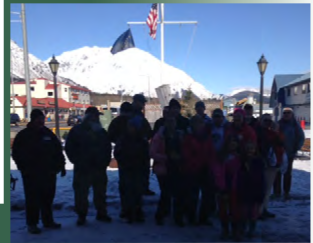
Birthday Flash Mob!