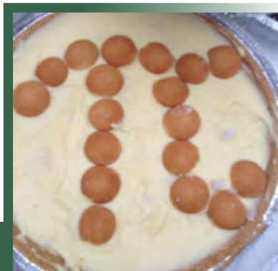
MO PIE