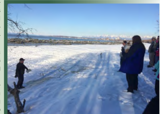
"NorthWes teaching at a great event"