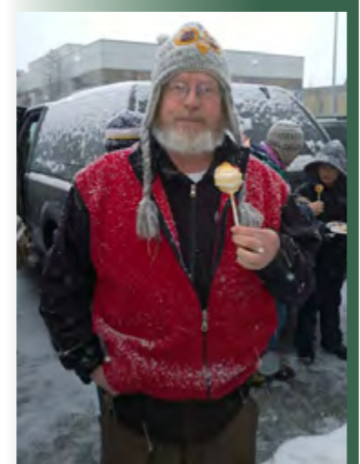
Li1gray enjoys a Pie POP