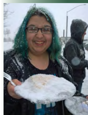
Jazzy cacher with a snowy pie!